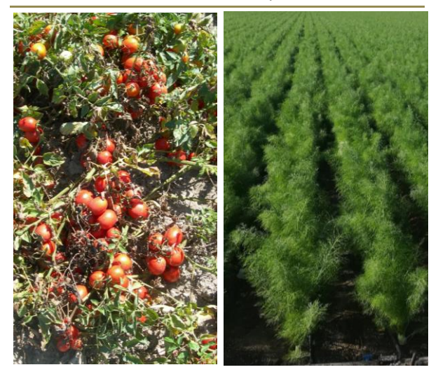
The suitable analytical data on the wrappings follow the prescriptions of the D.L.gs n. 75 of 29/04/2010 and following changes and /or integrations. All the data provided in the present publication are indicative, BIOS s.r.l. the right reserves its rights to modify them without obligation of warning.